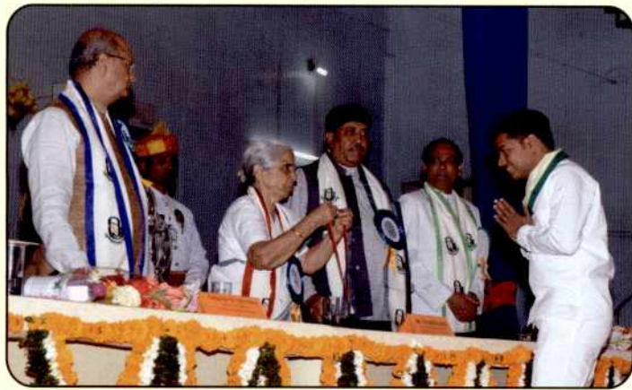
Excellent students were awarded with medals by Her Excellency Dr. Shrimati Kamala at 7th Annual Convocation of JAU

go ahead with innovative spirit. He recalled his Junagadh declaration for value added agricultural revolution made by him almost one decade back in an international conference.