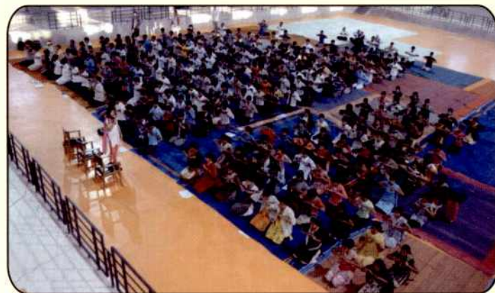
Students engaged in YES!+ workshop of Art of Living

A workshop on "NSIC (National Small Industries Corporation) activities" was jointly organized by the NSS Unit of College of Veterinary Science, Junagadh and NSIC Technical Service Centre, Rajkot at Junagadh on March 29, 2012. During this workshop information about the various self entrepreneurship skills, finance and making of project proposal was given to volunteers. The aim of the workshop was to create awareness about different self entrepreneurship ideas to rural unemployed youths through NSS volunteers. Total 85 volunteers participated in this programme.